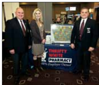
Thrifty White Pharmacy