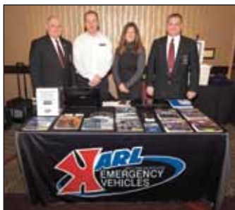
Karl Emergency Vehicles