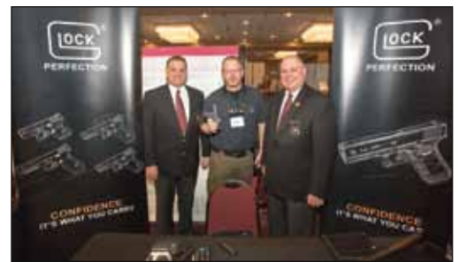
Glock Inc. donated a pistol to raffle