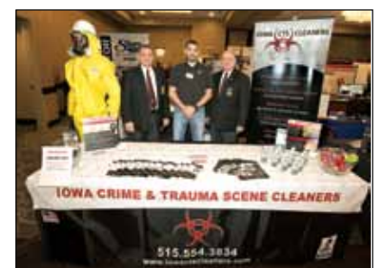
Iowa Crime & Trauma Scene Cleaners