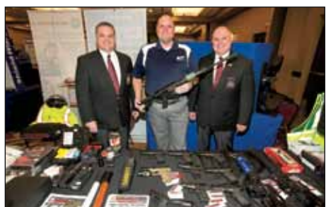
Sioux Sales donated a rifle to raffle; Dodge Law Enforcement booth, Stellar Services, LLC; Zuercher Public Safety Software