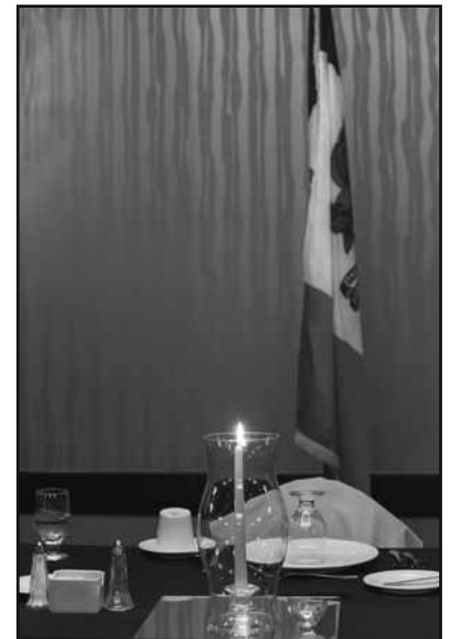
The Seat Left Empty: A place was left empty at the head table of the President's Banquet to remember those ISSDA members who are no longer with us.